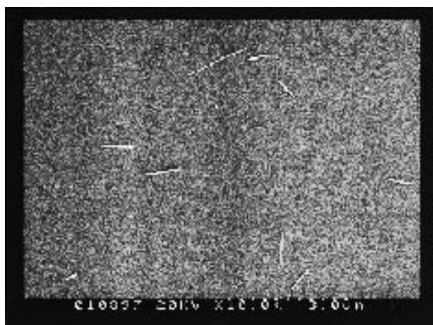
Fig. 2 Scanning electron micrograph of purified carbon nanotubes adsorbed on a chemically modified Si wafer